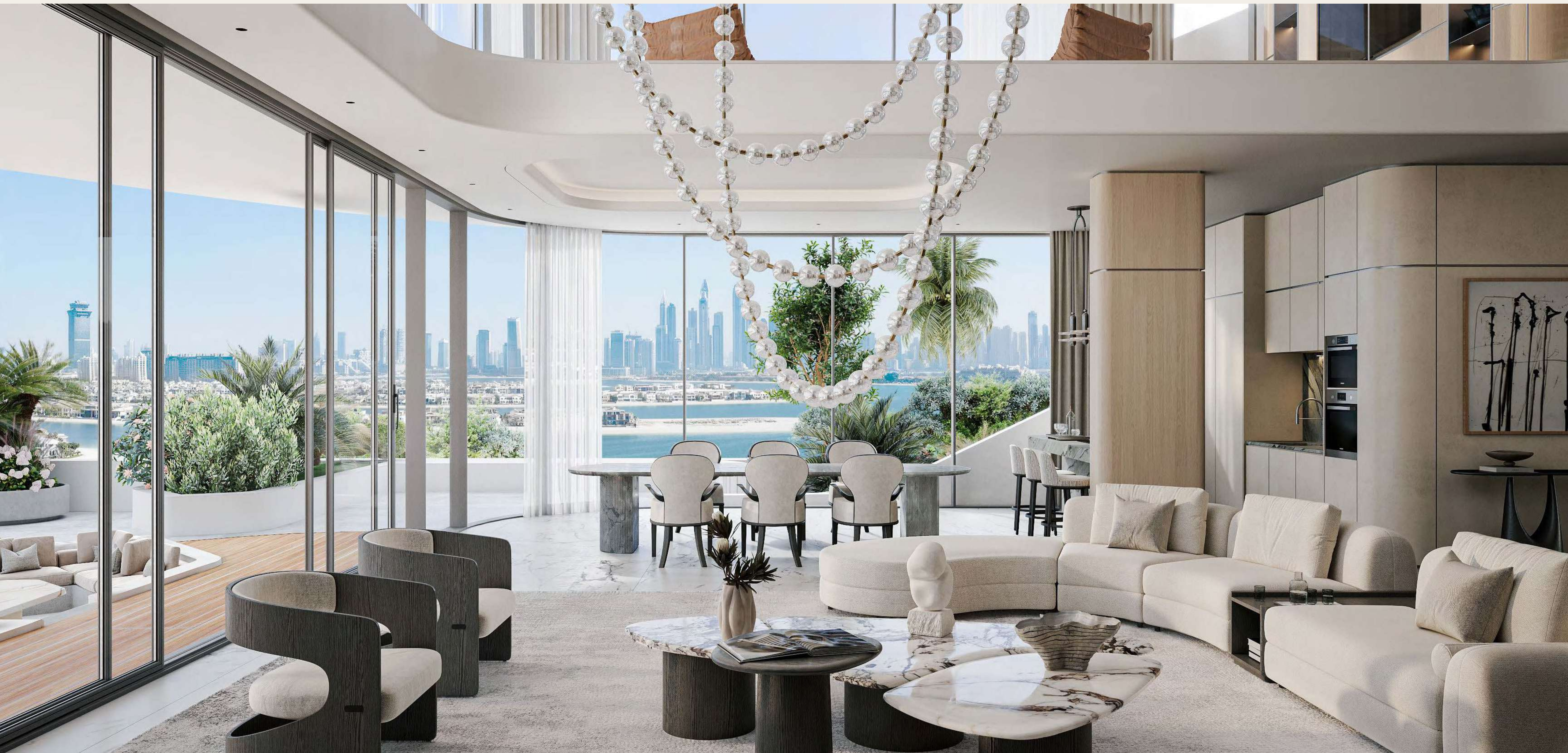
From open-plan flow to sensory stillness, interiors reflect a lifestyle in harmony with itself.