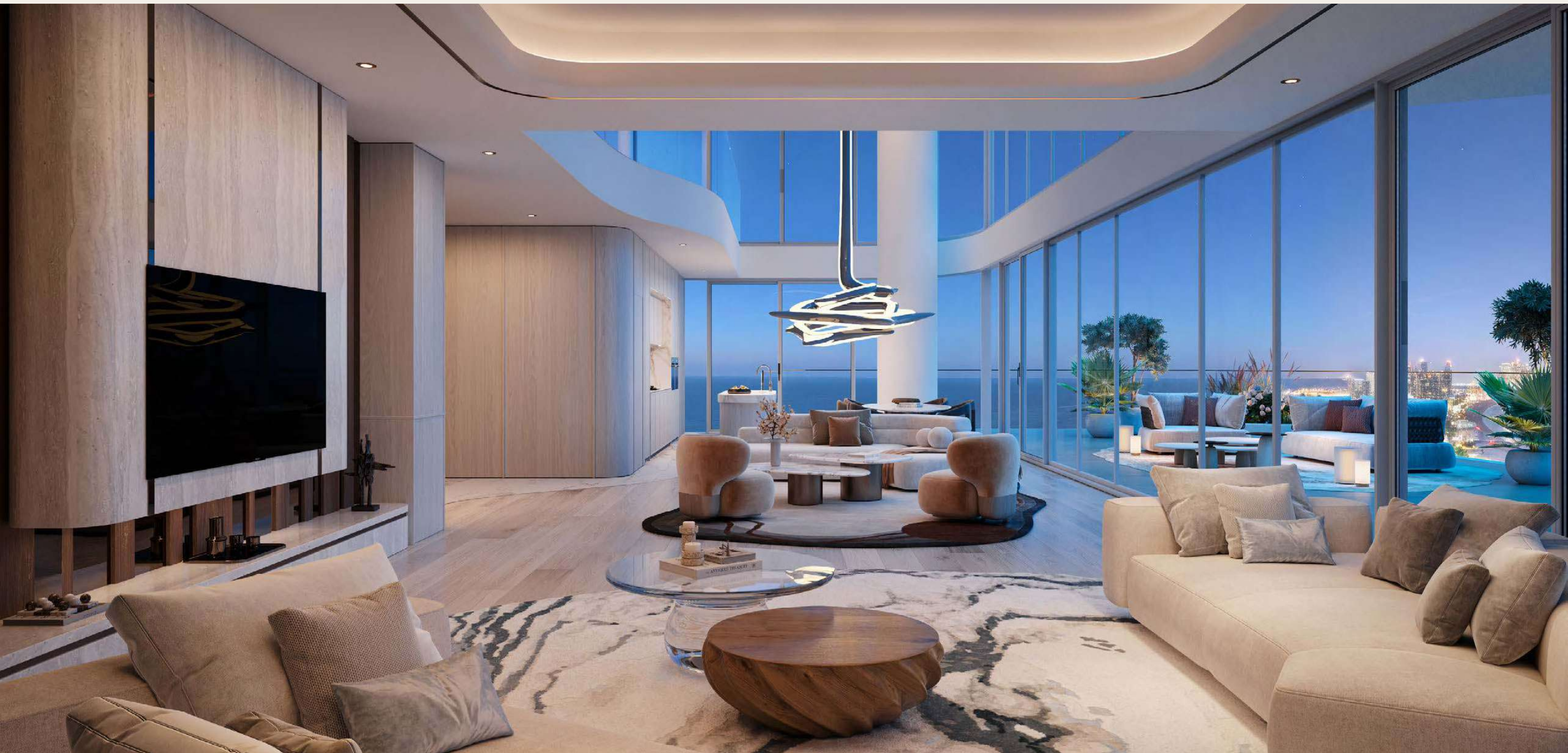
Spaces that flow, textures that breathe, and light that lingers.