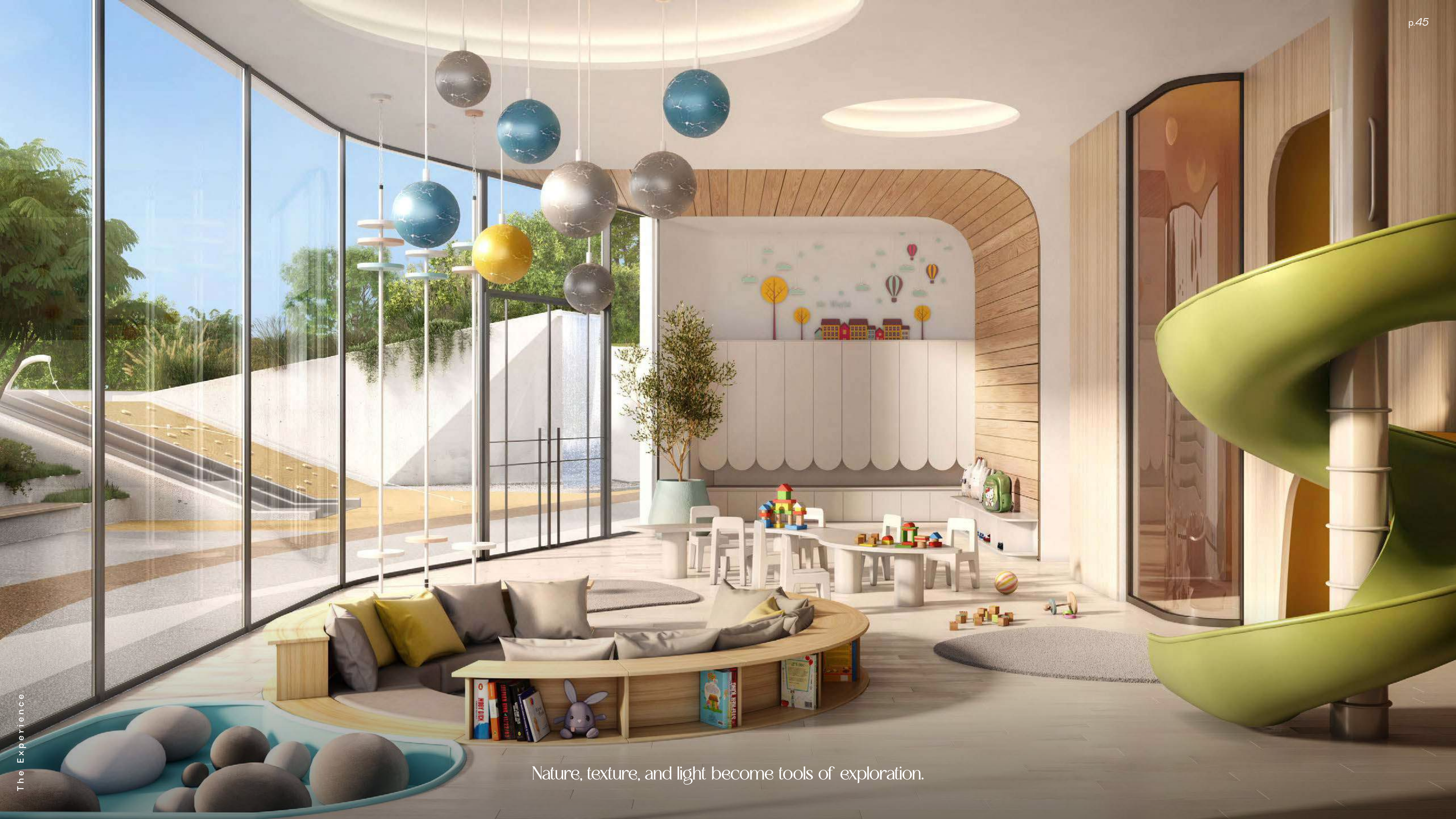
Nature, texture, and light become tools of exploration.